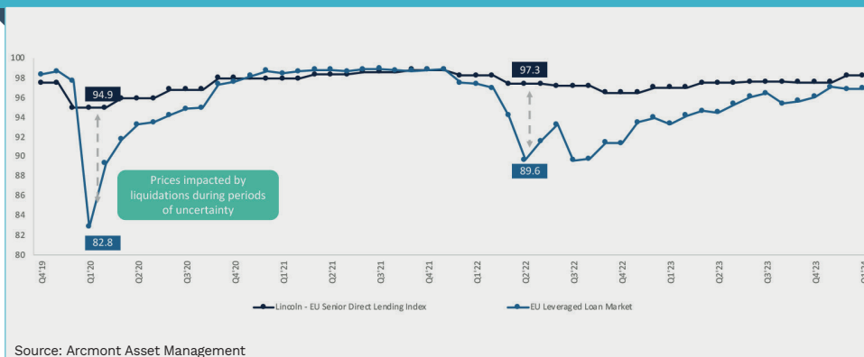
FIGURE 3: FAIR VALUE: DIRECT LENDING SENIOR LOANS VS. LEVERAGED LOAN MARKET – CASE STUDY FOR EUROPE 9

able to lend to larger, high-quality borrowers, at attractive terms given the limited competition in this part of the market.